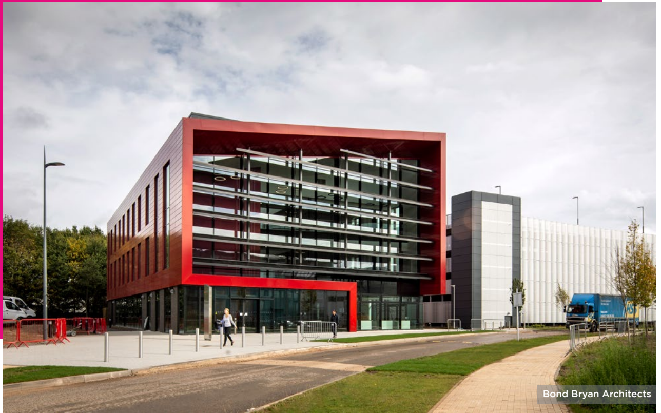
Bond Bryan Architects